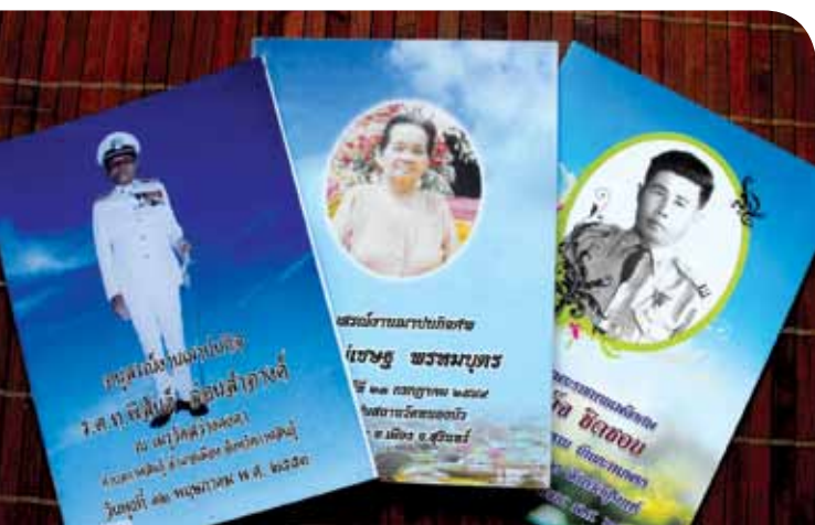
Over 200 northeast Thai memorial books were collected as part of the Fulbright-funded study.

case I got lonely and needed friends. Needless to say, I chose to use the office with friends. My new coworkers were from the Library and Information Science Department, and they welcomed me with open arms. Not only did they include me in their field research in nearby villages, they also took me to lectures and conferences, a day of rice-harvesting, a staff sports day, numerous long lunches, and an endless stream of social events starting with New Year’s time, and continuing through the Chinese New Year. They included me in graduation, which meant wearing a tailored